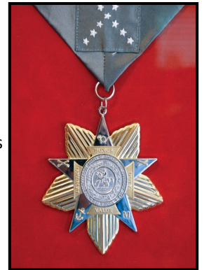
SCV Confederate Medal of Honor

the risk of life, above and beyond the call of duty" may be posthumously awarded a Confederate Medal of Honor created and minted by the Sons of Confederate Veterans (SCV). Over 60 such medals have been awarded to date, and many recipients come from the former Confederate Rolls of Honor. Only members of the SCV can submit candidates for the medal to the SCV's Confederate Medal of Honor Committee. A complete record on the nominee and documented proof of his deed of valor are required with the application. Medals for approved recipients are presented to institutions that agree in writing to display them publicly and to maintain their safety.