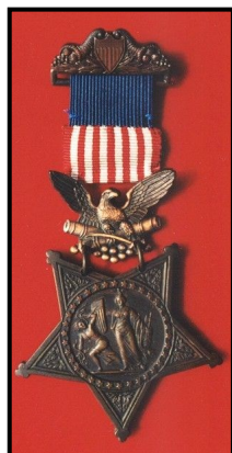
Medal of Honor for 1862-1897 shown

The Medal of Honor is the most prestigious decoration for U.S. military personnel who exhibit courage and self-sacrifice beyond the normal call of duty. In 1990, Congress established March 25 as National Medal of Honor Day. Creation of the medal, though, dates back to the Civil War. (Army